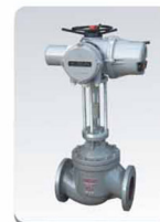
KZAZM电动套筒调节阀 Motorized Diaphragm Cage-guide Control Valve(KZAZM)