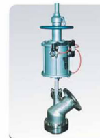
气动放料阀 Pneumatic Discharge Valve