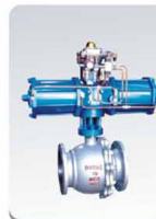
气动球阀 Pneumatic Ball Valve