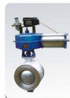
气动V型球阀 Pneumatic V-port Ball Valve