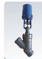
电子式疏水调节阀 Electric Trap Control Valve