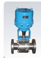
电子式调节球阀 Electric Control Ball Valve