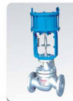
气动活塞切断阀 Pneumatic Piston Shut-off Valve