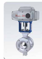
电动V型调节阀 Electric Control V-port Ball Valve