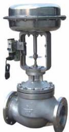
不锈钢调节阀系列 Stainless Steel Control Valve