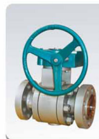
三段式高压球阀 3-pieces High-pressure Ball Valve