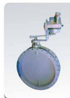
电动调节蝶阀 Motorized Control Butterfly Valve