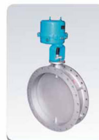
电动调节蝶阀 Electric Control Butterfly Valve