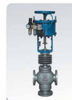
KZSNC气动高温快速切断阀 3-way High-temp Pneumatic Shut-off Valve