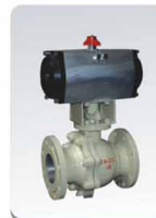
气动球阀 Pneumatic Ball Valve