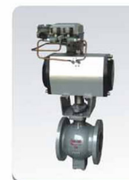
气动V型调节阀 Pneumatic Control V-port Ball Valve