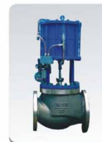
氧气专用切断阀 Shut-off Valve(Oxygen Only)