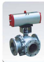
气动三通球阀 3-way Pneumatic Ball Valve