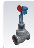
电动高温套筒调节阀 Motorized & High-temp Cage Guide Control Valve