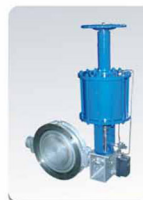
KZSCW气动活塞调节蝶阀 Pneumatic Telescopic Butterfly Valve (KZSCW)