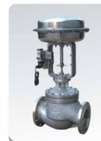
KZMQ气动薄膜调节阀 Pneumatic Diaphragm Shut-off Valve(KZMQ)