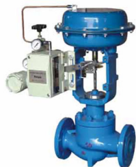
KHCB笼式双座调节阀 Double-seated Cage Guide Control Valve (KHCB)