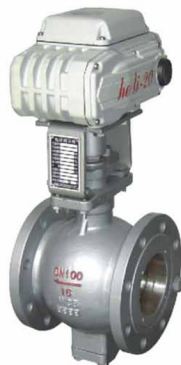
电动V型调节阀 Electric Control V-port Ball Valve