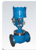
KZSPQ气动快速切断截止阀 Pneumatic Quick Shut-off Globe Valve(KZSPQ)