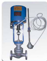
KZZWP自力式温度调节阀 Temp-electric Self-Operated Control Valve(KZZWP)