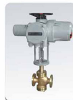
氧气专用电动智能双座调节阀 Motorized & Intelligent Double-seated Control Valve(Oxygen only)