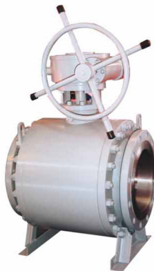
三段式球阀 3-pieces Ball Valve