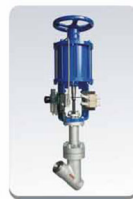
气动活塞Y型疏水阀 Pneumatic Diaphragm Trap Control Valve