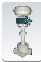
KHSC笼式单座调节阀 Single-seated Cage Guide Control Valve (KHSC)