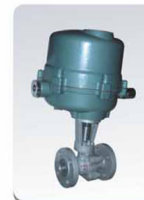
防爆电动球阀 Explosion-proof Electric Control Ball Valve