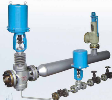
减温减压装置系列 Valve Team Of Reduce Temp & Pressure