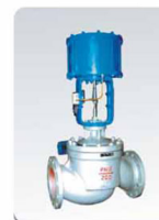
气动套筒切断阀 Pneumatic Cage-guide Shut-off Valve