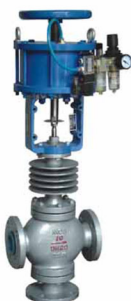
气动三通切断阀 3-way Pneumatic Shut-off Valve

本系列气动切断阀由切断机构和气动执行机构组成，该阀具有快速启闭、结构简单、操作方便、密封性好等特点。主要应用于无杂质、无颗粒的液体、气体介质，要求快速关闭，快速放空的自动控制场合。