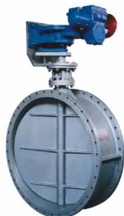
大口径低负载蝶阀系列 Big-port Motorized Butterfly Valve

本系列蝶阀具有流量大、压力损失小、动作灵敏稳定、使用可靠等优点，密封形式有硬密封、软密封、通风等，可满足不同工艺的需要，特别适用于带有悬浮或浓浆状流体及各种大流量管路，广泛用于电力、石化、冶金、制药、造纸、水处理、城市供暖等自动控制场合。