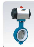
精小型气动美标衬氟蝶阀 Pneumatic Lined Butterfly Valve(ANSI)