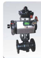
气动铸铁球阀 Pneumatic Ball Valve(Cast Iron)