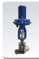
KHPC高压笼式调节阀 High-Pressure Cage-guide Control Valve (KHPC)