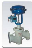
气动衬氟单座调节阀 Pneumatic Diaphragm Lined Single-seated Control Valve

全面支持您的自动控制系统 We Fully Support Your's Automatic Control System