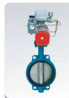
气动蝶阀 Pneumatic Rubber Butterfly Valve