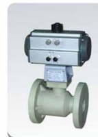
气动全塑球阀 Pneumatic Plastic Ball Valve