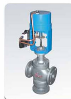
气动活塞快速切断阀 3-way Pneumatic Shut-off Valve