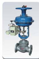
气动薄膜精小型调节阀 Pneumatic Diaphragm Control Valve