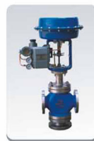
气动三通调节阀 3-way Pneumatic Diaphragm Control Valve