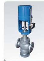
气动三通切断阀 3-way Pneumatic Shut-off Valve