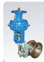
气动薄膜调节蝶阀 Pneumatic Diaphragm Control Butterfly Valve