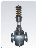
自力式压力调节阀 Pressure Self-Operated Control Valve