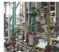
四川化工集团使用现场