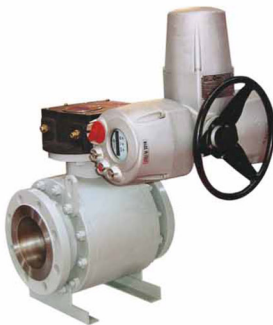
电动智能调节球阀 Motorized & Intelligent Control Ball Valve

本系列O型球阀、球芯采用O型通孔。固定球式阀门采用弹性阀座补偿密封。双保护盖式填料函装置。此阀门的流量系数大，流阻小，角行程启闭迅速。适用于化工、冶金、造纸、给排水等系统的控制。