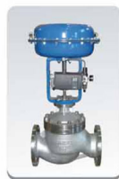
气动薄膜套筒调节阀 Pneumatic Diaphragm Cage-guide Control Valve