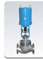
电子式调节阀 Electric Control Valve