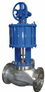
高性能气动快速切断阀 High-performance Pneumatic Quick Shut-off Valve