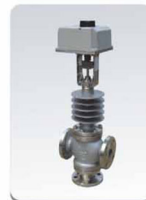
三通温控调节阀 3-way Temp-electric Control Valve