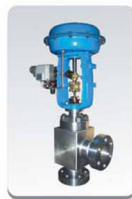
KZMAS气动薄膜高压角型调节阀 Pneumatic Diaphragm High-Pressure Angle Control Valve (KZMAS)