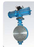
KWB300高性能蝶阀 High-performance Butterfly Valve(KWB300)