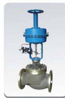
氧气专用气动薄膜套筒调节阀 Pneumatic Diaphragm Cage-guide Control Valve (Oxygen only)