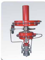
KZZV自力式差(微)压调节阀 Differential-Pressure Self-Operated Control Valve(KZZV)

全面支持您的自动化控制系统 We Fully Support Your's Automatic Control System