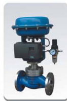
KZHP精小型气动单座调节阀 Pneumatic Diaphragm High-Pressure Single-seated Control Valve (KZHP)