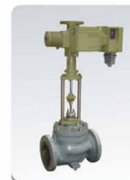
电动智能调节阀 Motorized & Intelligent Control Valve