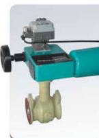
气动偏心旋转阀 Pneumatic Eccentric Rotating valve