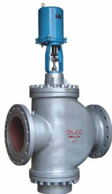
KZDLN电动双座调节阀 Big-port Electric Double-seated Control Valve (KZDLN)