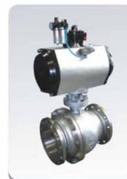
气动快速切断球阀 Pneumatic Quick Isolated Ball Valve