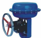
气动薄膜执行机构 Pneumatic Diaphragm actuator