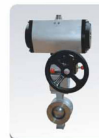
气动V型调节阀 Pneumatic Control V-port Ball Valve