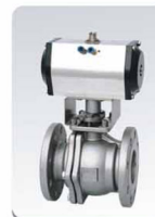
日标气动球阀 Pneumatic Ball Valve(JIS)