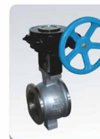
手动V型球阀 Hand-operated V-port Ball Valve