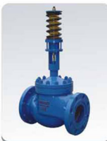
高压自力式压力调节阀 High-Pressure Self-Operated Control Valve