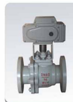
电动衬氟球阀 Electric Lined Ball Valve