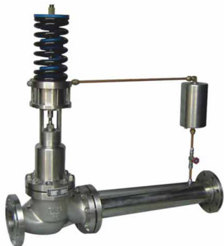
全不锈钢自力式压力调节阀组 Stainless steel Self-Operated Control Valve