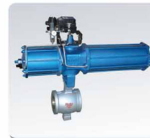
气动V型调节阀 Pneumatic Control V-port Ball Valve