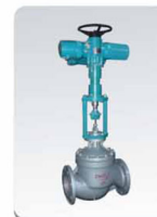
电动智能调节阀 Motorized & Intelligent Control Valve