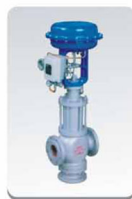
气动薄膜波纹管密封调节阀 Bellow Sealed Pneumatic Diaphragm Control Valve