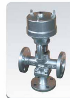
KZXQ轻型气动活塞切断阀 Pneumatic Quick Shut-off Valve (KZXQ)