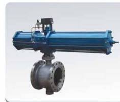
气动大口径V型球阀 Big-port Pneumatic V-port Ball Valve