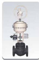
气动高压调节阀 High-Pressure Pneumatic Diaphragm Control Valve