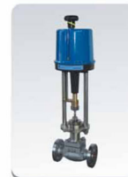
KHLS小口径单座调节阀 Small-port Single-seated Control Valve (KHLS)