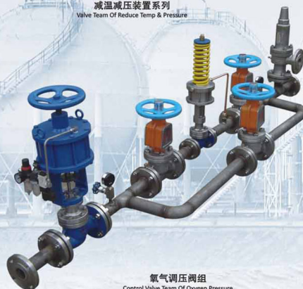
氧气调节阀组 Control Valve Team Of Oxygen Pressure