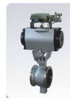
气动V型调节阀 Pneumatic Control V-port Ball Valve