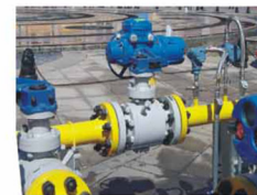
四川天然气集团使用现场