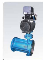
气动伸缩蝶阀 Pneumatic Telescopic Butterfly Valve