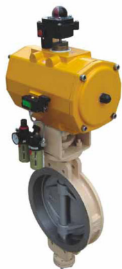
KZSHW气动活塞调节切断蝶阀 Pneumatic Control & Shut-Off Butterfly Valve