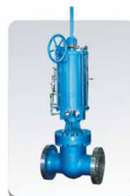
气动切断阀 Pneumatic Quick Shut-off Gate Valve