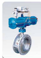
气动硬密封调节蝶阀 Hard-sealed Pneumatic Control Butterfly Valve