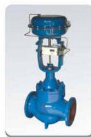
KTOB笼式调节阀 Pneumatic Diaphragm Cage Control Valve (KTOB)