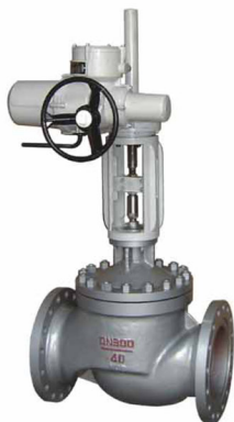
电动智能笼式调节阀 Motorized & Intelligent Cage Guide Control Valve

本公司生产的电动调节阀系列高性能产品，具有结构新颖、流阻小、流量系数大、调节精度高等特点，被广泛应用于电力、石化、冶金、制药、造纸、水处理、城市供暖等自动控制场合。