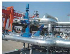
南通(惠生)造船集团使用现场