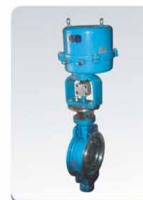
KZDLW电子式电动调节蝶阀 Electric Control Butterfly Valve