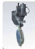
电动衬氟蝶阀 Electric Lined Butterfly Valve