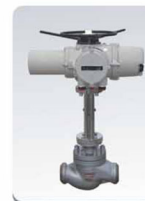
KHPS电动高压单座调节阀 Motorized High-Pressure Single-seated Control Valve(KHPS)