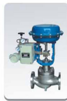
KHTS单座调节阀 Single-seated Pneumatic Diaphragm Control Valve (KHTS)