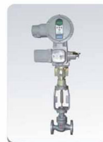
电动智能调节阀 Motorized & Intelligent Control Valve