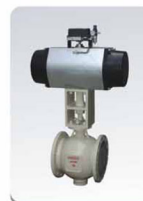
气动V型调节阀 Pneumatic Control V-port Ball Valve