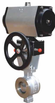
气动精小型V型球阀 Pneumatic V-port Ball Valve

本公司生产的V型球阀是一种高精度控制阀门。V型球芯设计带有特殊的V型缺口，具有精确的截流控制功能，密封性能优越、结构紧凑、流量大、可调比大，因此广泛应用于石油、化纤、电力、制药、造纸、水处理等各种带粘性介质的控制场合。